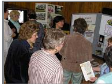
Members browse exhibits at our 4/21 program of women business owners in Lombard.